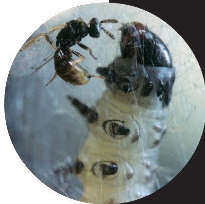
STEPHEN AUSMUS (K10910-1)

This parasitic wasp (about 2 millimeters long), Colpoclypeus florus , attempts to sting a larva of the oblique-banded leafroller. The wasp’s stinger (protruding from its abdomen) injects a toxin that causes the leafroller to spin extra-thick webbing around itself.